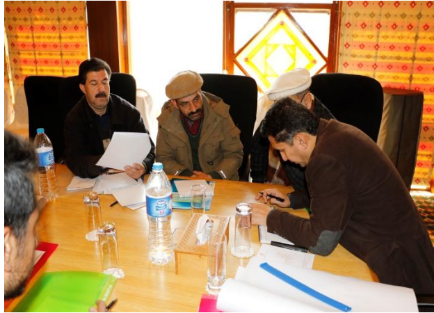
Figure 5: Participants while working in group.