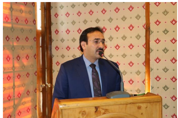
Figure 2: Honorable Chief Guest, Secretary FWED GB addressing the audience.